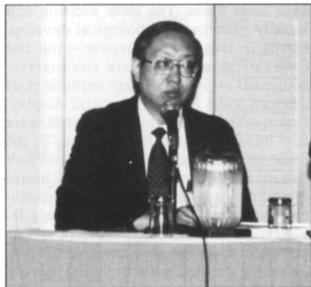
Figure 3. R.P.H. Chang of Northwestern University, president of the International Union of Materials Research Societies, chairing the Special Opening Lecture Session.