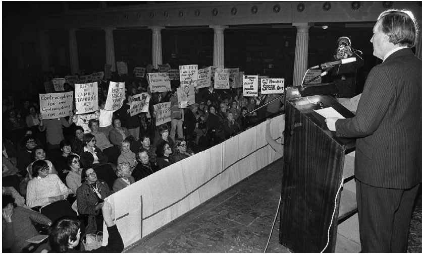
Figure 9.1 Protest during Taoiseach Charlie Haughey's speech at the opening of the National Forum on the UN Decade for Women 1975–85, Dublin, 15 November 1980.