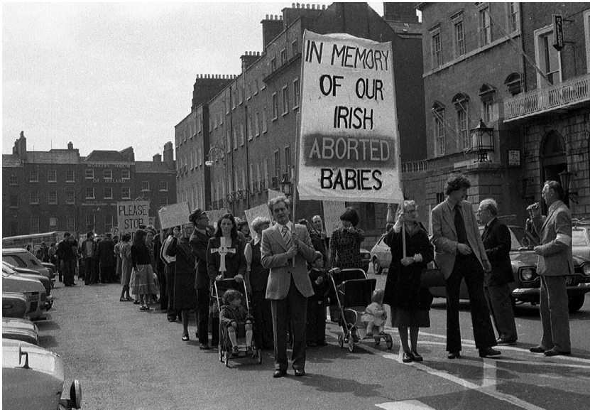
Figure 8.3 Pro-life march and rally, GPO, Dublin, 12 May 1979.