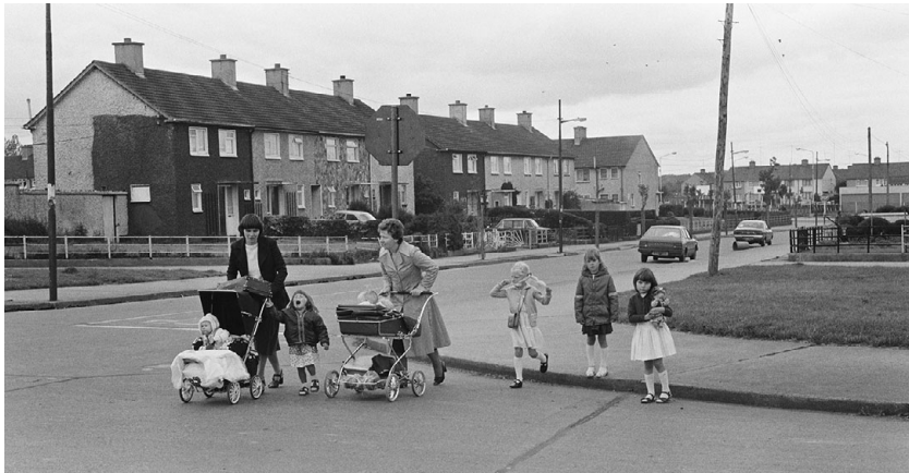
I.1 Heavy Traffic (2) , Ballyfermot, Dublin, June 1981.

personal experiences of individuals and activists. 107 It aims to illustrate that the Irish history of contraception was not exceptional, but that Irish men and women had much in common with the experiences of individuals in other predominantly Catholic European countries, such as Italy, Spain and Switzerland, as well as the experiences of individuals in regions which did not have the same legal restrictions on contraception such as Quebec, England and the United States. 108 Finally, the book argues that unlike other countries, Ireland did not experience a sexual revolution until at least the 1990s. I argue that the Family Planning Act of 1979 was not a turning point, and that restricted access to contraception, and shame and stigma around sexual matters more generally, persisted until at least the 1990s, if not beyond.