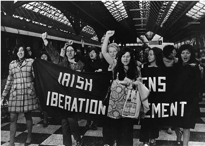
Figure 7.1 Irish Women's Liberation Movement Contraceptive Train protest, 22 May 1971.