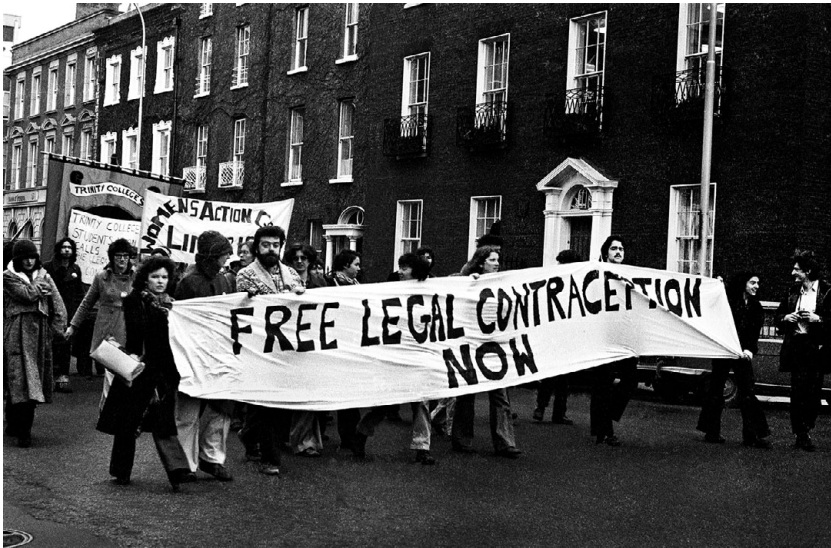
Figure 7.10 CAP march in Dublin, 3 December 1978.

Evidently, in spite of the introduction of the Family Planning Act in 1979, the issue of contraception remained controversial and divisive.