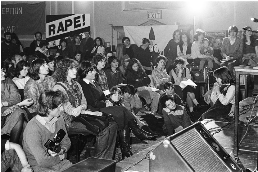
Figure 9.2 CAP anti-bill demo Junior Commons Room, Trinity College Dublin, November 1980.