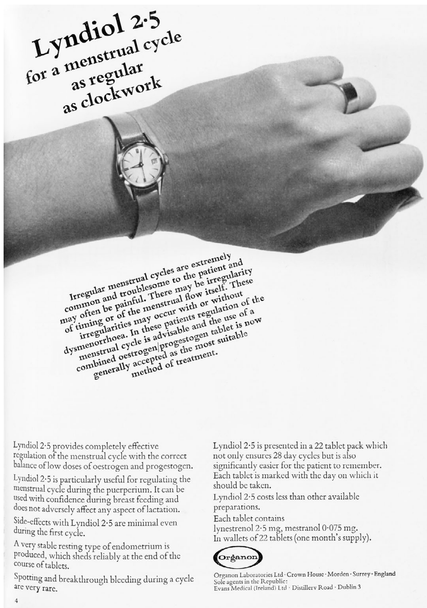
Figure 4.1 Advertisement for Lyndiol 2.5, Journal of the Irish Medical Association , volume LX, no.365, November 1967.