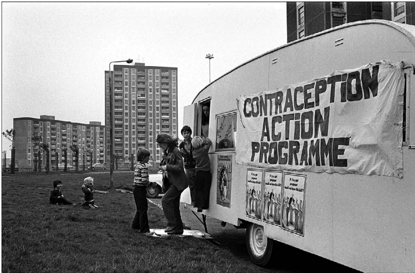
Figure 7.4 CAP caravan, Ballymun, Dublin, 13 October 1979.