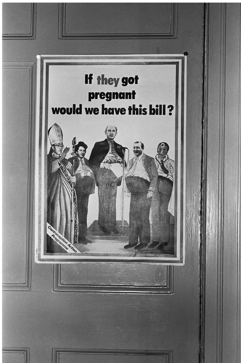
Figure 7.6 CAP poster, Limerick Family Planning Clinic, July 1981. Photograph by Beth Lazroe. All rights reserved, DACS 2022.