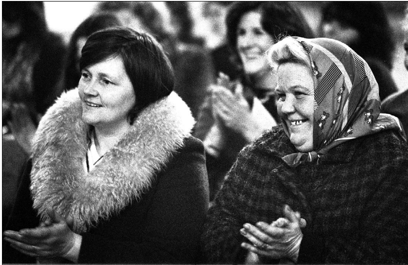
Figure 7.3 Two women in the audience at CAP public meeting in Ballyfermot, Dublin on 21 March 1978.

the Irish press. 95 Signature campaigns were also utilised by the group. CAP members remarked in Wicca magazine that in the course of collecting signatures for a national campaign, they were ‘saddened and shocked at the appalling ignorance because of lack of access in information and education and unavailability of Family Planning’. 96