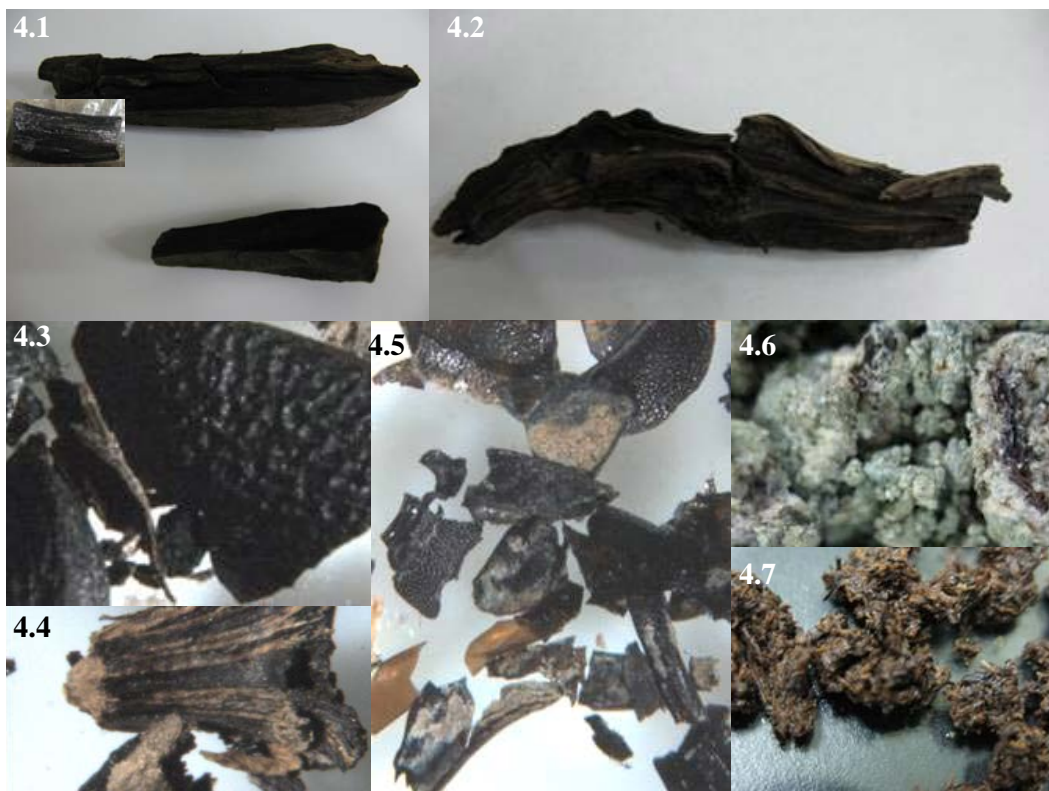
Figure 4 Photographs showing various organic materials obtained from locality 12. 4.1 and 4.2 show pieces of wood. The geometric shapes of the pieces of wood in 4.1 appear to indicate human-related modification compared to the naturally appearing wood (possible part of a root) of 4.2. In addition, 4.3 and 4.4 show pieces of seeds. 4.5 shows various pieces of insects. 4.6 shows weathered quartz-rich bedrock. 4.7 is a photo of thin (~2 cm) roots extracted from the bedrock.