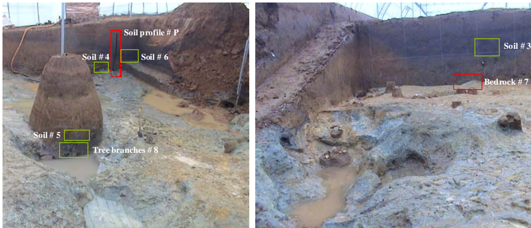
Figure 3 Photographs of the west side of locality 12 showing (left) the locations of sample spots 4, 5, 6, and 8 (highlighted in green) and soil profile #P (highlighted in red) marking the location of the soil profile in Figure 2; and (right) sample spots 3 and 7 on the east side of locality 12.