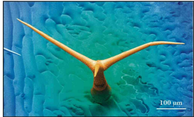
Specimen: Leaf of Arabidopsis Thaliana Instrument: Hitachi S-3500N SEM

The journey to discover and understand that which cannot be readily seen has often inspired bold exploration.