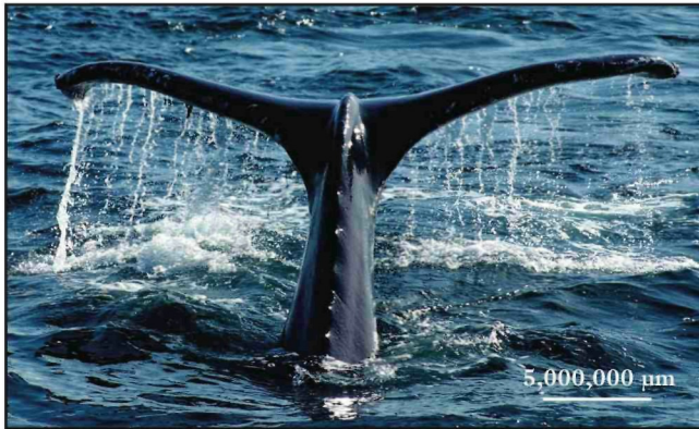
Specimen: Humpback Whale (Genus: Megaptera) Instrument: The Naked Eye