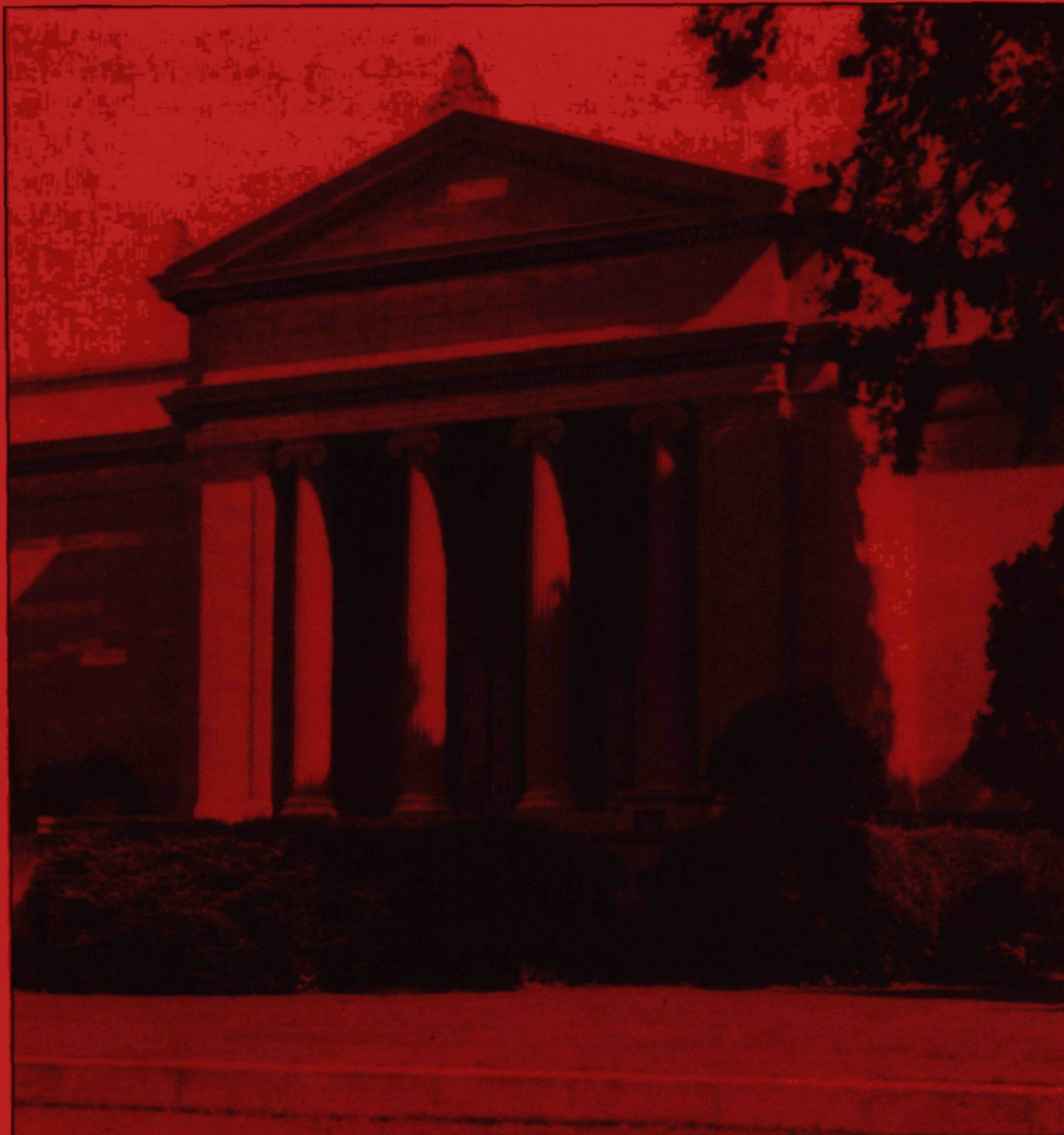
The Cleveland Museum of Art

Dynix has successfully adapted to meet the specialised needs and circumstances of art libraries adding new formats to accommodate photographs, slides, computer images and designs and new facilities for closed stack access and requisitioning. Dynix is meeting the challenge.