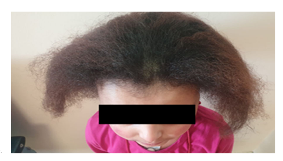
Figure 1. Wooly hair of the patient.