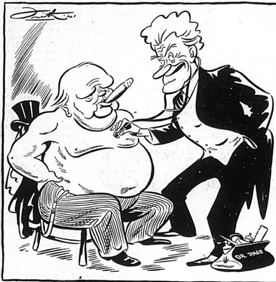
"If you took more of our surplus primary produce in your ration you'd be as sound as a bell."

EDITED BY KENT FEDOROWICH AND JAYNE GIFFORD