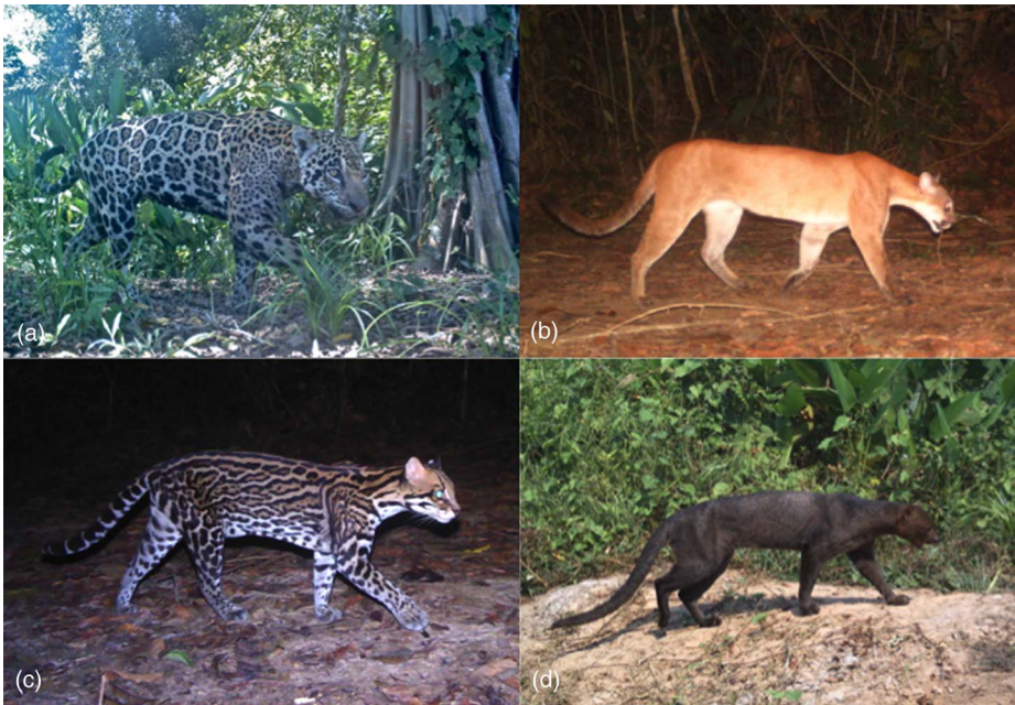
PLATE 1 Felid species recorded by camera traps across the study site in the Magdalena river valley of Colombia: (a) jaguar Panthera onca , (b) puma Puma concolor , (c) ocelot Leopardus pardalis and (d) jaguarundi Herpailurus yagouaroundi .