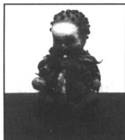
Fetish #3 by Renée Stout.

69 color, 58 b&w illus. 224 pp. Paper: 1-56098-274-8P $34.95