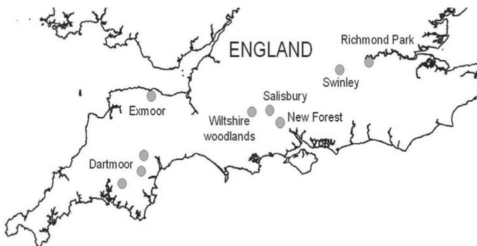
Fig. 1. Locations of field collections of questing Ixodes ricinus ticks in southern England.

Genbank with the use of Bionumerics software (Applied Maths NV, Belgium). A. phagocytophilum was not sequenced.