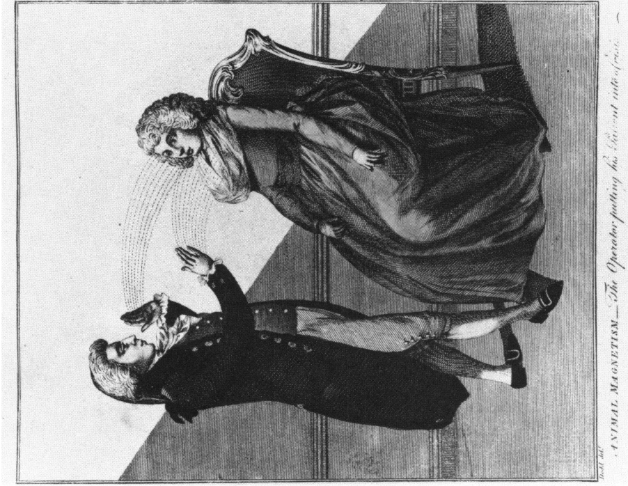
Plate 2. Animal magnetism scene. From Ebenezer Sibly, A key to physic and the occult sciences , 5th ed., London, 1814, facing p. 200.