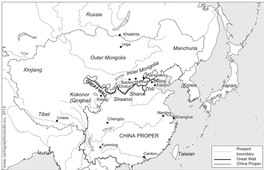
Figure 1. The Qing Empire (c.1800).

Wall. By 1800, a total of twenty centralized administrative units had been established in Inner Mongolia, to manage the growing Han population there. Thus the territorial and demographical expansion of the Qing created the legal and administrative framework for the influx of Chinese capital and migrants into the Mongol periphery.