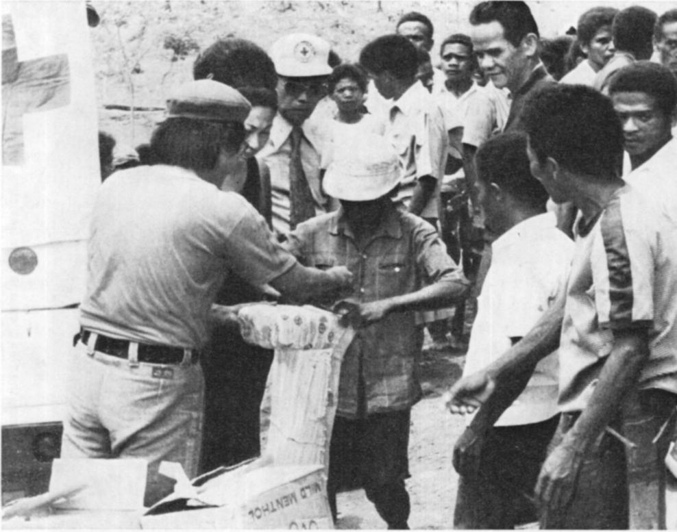
Activities of the Philippine Red Cross for the country's cultural minorities : relief distribution.