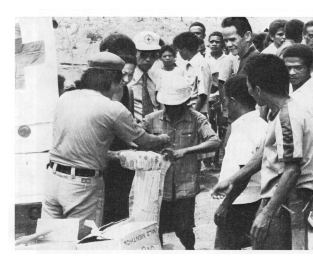
Activities of the Philippine Red Cross for the country's cultural minorities: relief distribution.