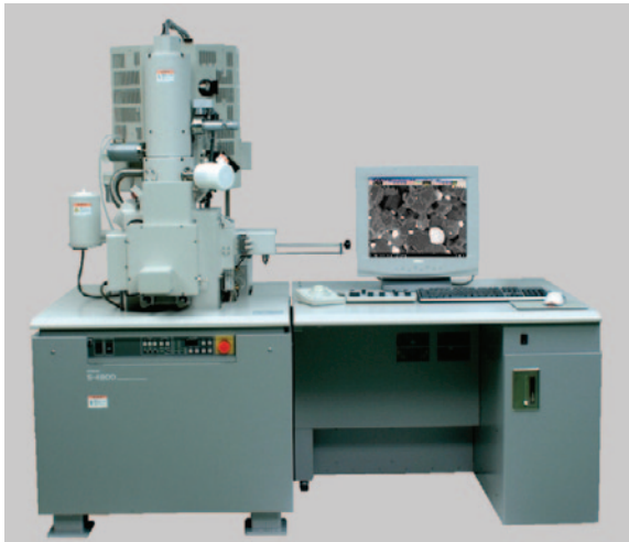
S-4800 High Resolution FESEM