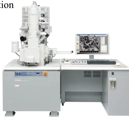
SU8000 Triple Detector FESEM