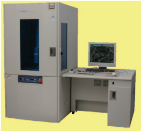
S-5500 UHR FESEM

The nano world is more diverse than ever before, so why limit your choices? Hitachi offers more choices than any other manufacture of Ultra High Resolution Field Emission SEM. From the world's highest resolution S-5500 UHR FESEM, guaranteed at 0.4nm resolution, to the SU-70 Analytical FESEM, capable of producing greater than 200nA beam current, Hitachi's choices are better than ever. Our field proven S-4800 and newly designed SU8000 UHR FESEM with the worlds first triple detection system, provide unsurpassed resolution, ease of operation, and the most reliable instruments in the industry. Hitachi, the right choice for your application