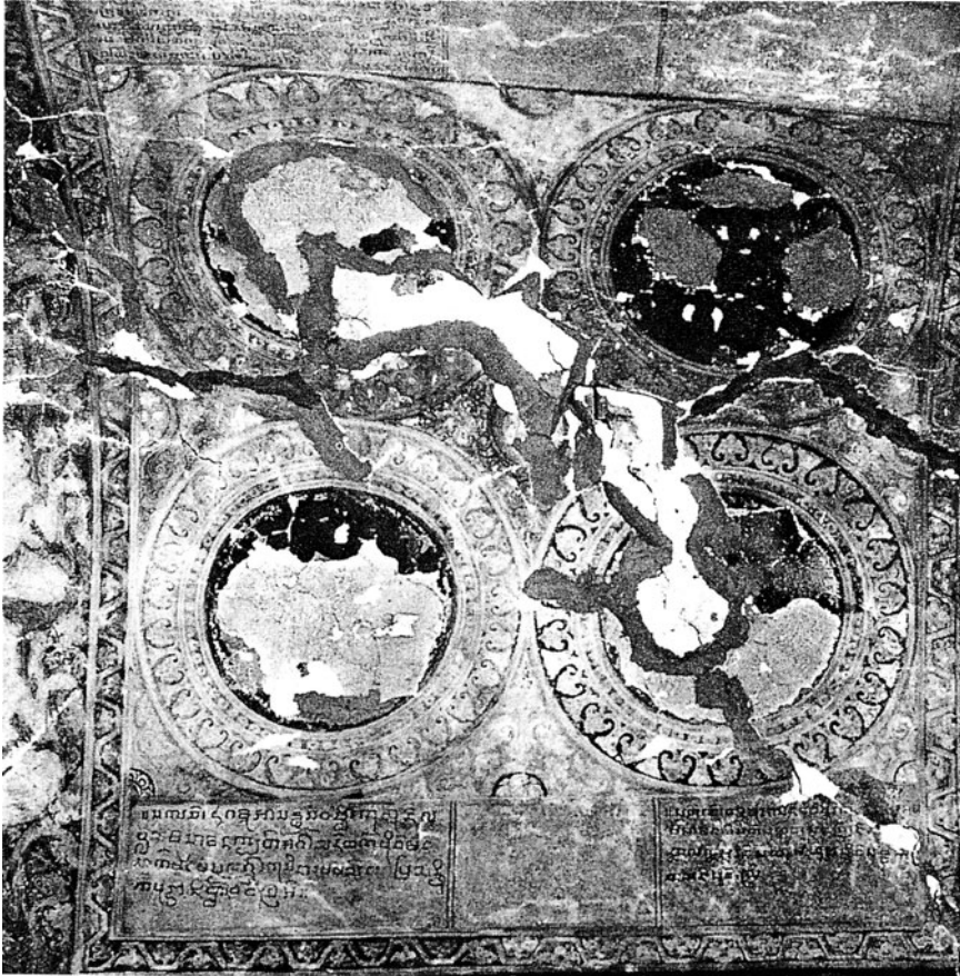
Figure 5. Kutha ink inscription (left part). Source: P. Pichard, Inventory of the Monuments at Pagan (Paris, 1994–1995), vol. 4, no. 845.

As could be expected, the Ajjana era is a similarly rare occurrence. The only examples of its use during the Bagan period come from two short painted inscriptions on the ceilings of temples 845 (Kutha) and 1471 (Theinmazi) at Bagan. Both consist of four horoscopes referring to important events in the Buddha's life: conception (Maya's dream), birth, enlightenment, and parinibban . 26 In the case of the Kutha temple, the readings of the four dates are interspersed with a second inscription describing the 'Buddhist paradise' Uttarakuru (Figure 5). Apart from these two instances, which are directly related to the four 'great' events in the Buddha's life, the Ajjana era was apparently not used for practical purposes such as the recording of a donation.