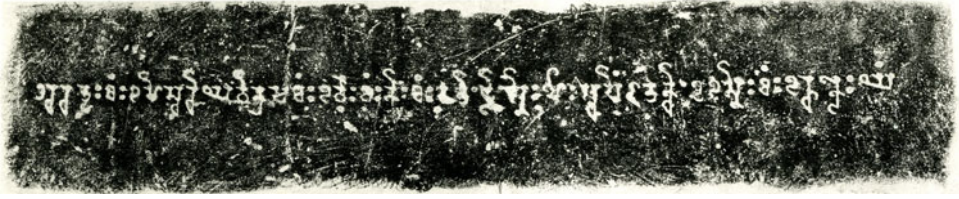
Figure 1. Suryavikrama's relative urn inscription.