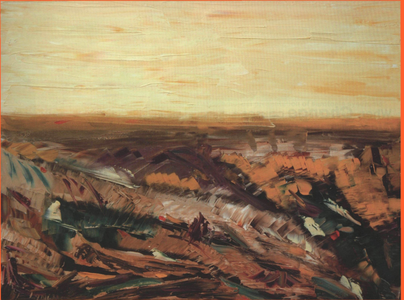
'Evening' by AL. Oil on canvas (30" x 40")