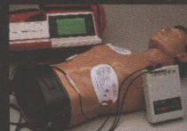
CLINICAL SUPPORT AND TRAINING TOOLS