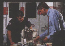
UNSURPASSED TECHNICAL SERVICE