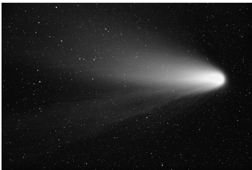
Figure 1.1 Optical forces in the sky. Besides the brightness of its coma, a comet is typically remembered by the length of its tails. Comet Hale–Bopp, which passed perihelion on 1 April 1997, lived up to expectations for it, boasting a blue ion tail (bottom) and a white dust tail (top) of exceptional extent, due respectively to the solar wind and to the Sun's light force.

The ability of light to exert forces has been known for quite some time. In fact, Johannes Kepler (1619) recognised that the tails of a comet – an example of which is shown in Fig. 1.1 – are due to the force exerted on the particles surrounding the comet's body by the Sun's rays. However, optical forces are extremely small; so small, in fact, that only in recent years, and only thanks to the advent of the laser, has it been possible to concentrate enough optical power into a small area to significantly affect the motion of microscopic particles, thereby leading to the invention of optical tweezers . Optical tweezers are generated by a tightly focused laser beam that can hold and manipulate a particle in the high-intensity region that is the focal spot. Optical tweezers and other optical manipulation techniques have heralded a revolution in the study of microscopic systems, spearheading new and more powerful techniques, e.g., to study biomolecules, to measure forces that act on a nanometre scale and to explore the limits of quantum mechanics. This book provides a comprehensive guide to the theory [Chapters 2–7], practice [Chapters 8–12] and applications [Chapters 13–25] of optical trapping and optical manipulation.