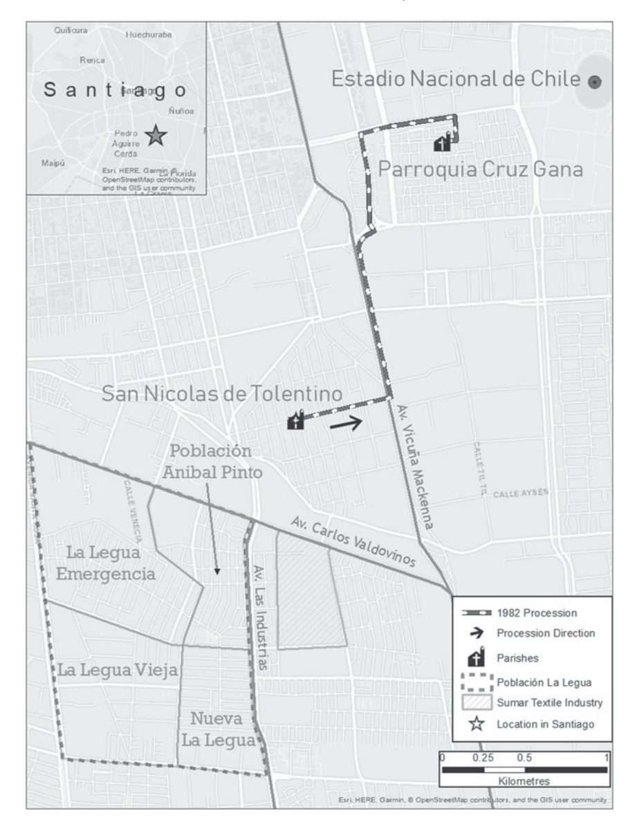
Figure 1. Route of the 1982 Via Crucis Procession through the Industrial Sector of Southern Santiago