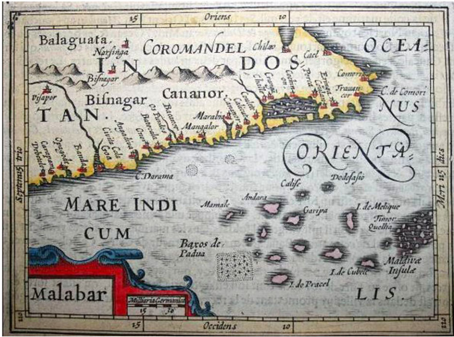
Map 3. Abraham Ortelius, Map of Malabar, 1580.