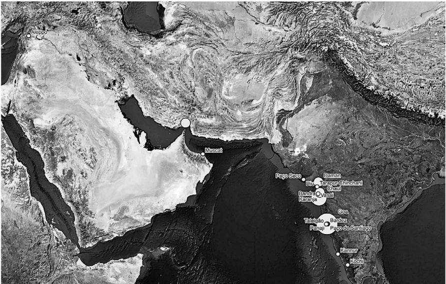
Maps 2a and 2b. Birthplace and residence of enslaved, captured, or freed subjects in the Reportorio. Size of location marker corresponds to the number of subjects.