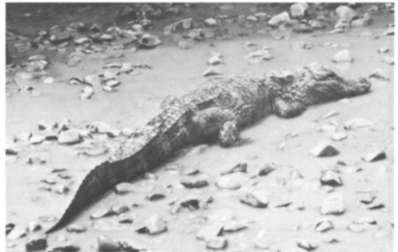
Chinese alligator in a concrete pool (which has been drained prior to resurfacing) at Xiadu Tree Farm Alligator Farm, Xuancheng ( Myrna E. Watanabe ).

classification for the others was either unreliable or unavailable. By the end of July the alligator farm had 89 animals: all but one were adults. Although some of these may have been included in our wild count, capture data suggest that the overlap was only for one or two animals. It is thus apparent that the local residents know where to find the alligators, and that significantly more animals existed in the wild than we counted. It is possible that we did not census some of the areas from which these animals originated, as both time and accessibility problems limited us to a few of the most convenient areas.