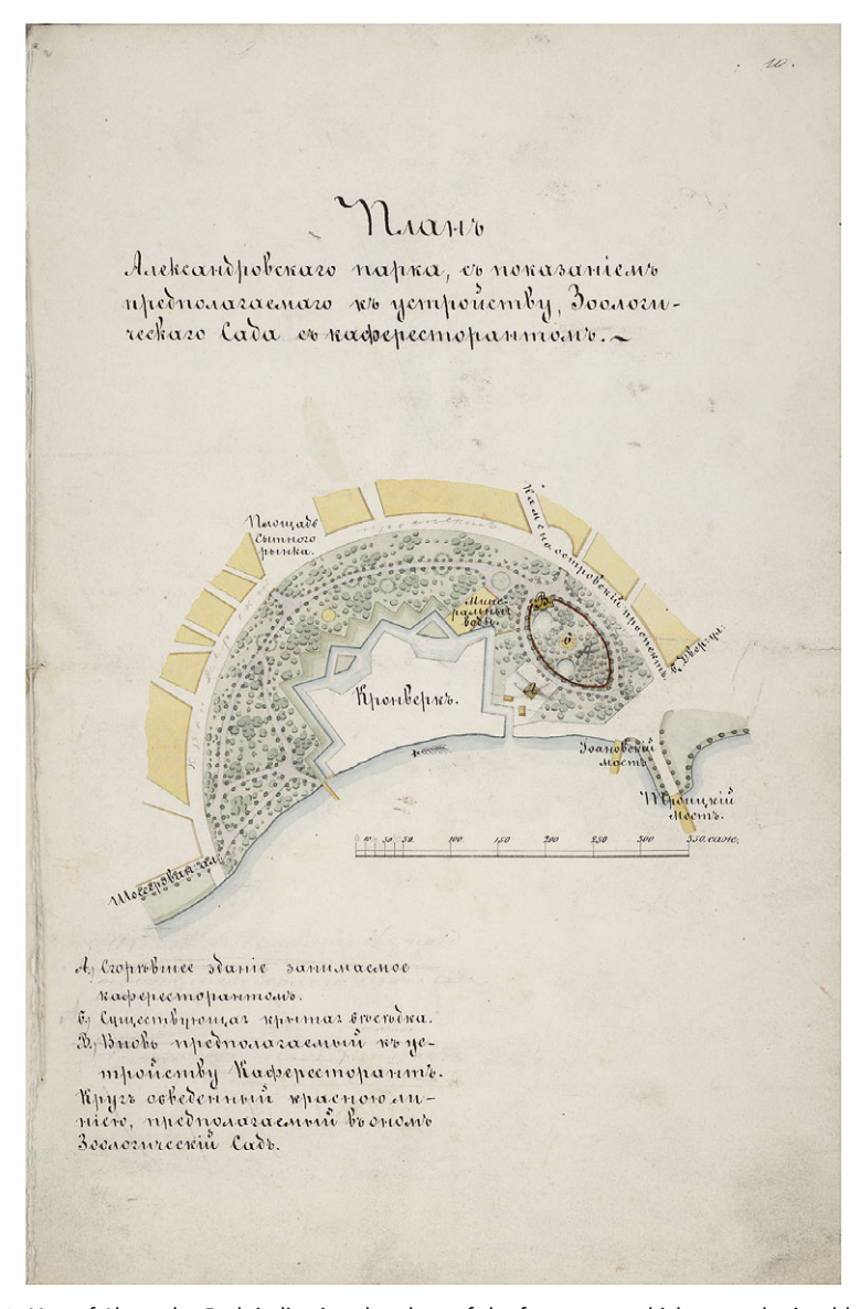
Figure 1. Map of Alexander Park indicating the place of the future zoo, which was submitted by Julius Gebhardt to the general governor of St Petersburg in November 1864.

zoo into the urban fabric, the governor general of St Petersburg, who apparently approved the idea, had to obtain the agreement of the minister of transport, Pavel Melnikov, who, in turn, had to secure an amendment of the emperor's decree.