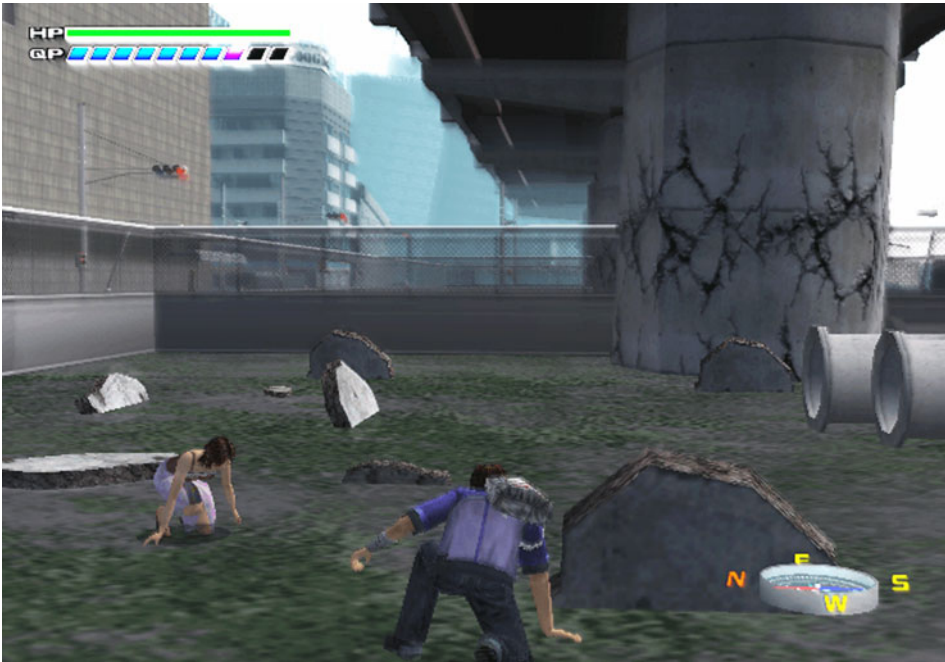
Figure 2. Masayuki mimics the real-world earthquake preparedness drill of “drop, cover, and hold on” amidst citywide destruction.

Report also features collapsing buildings, falling rubble, and the occasional cadaver (see figure 2 ). However, apart from the game’s opening cinematic, which showcases the large-scale destruction of Capital City as the earthquake hits, the subsequent survival experience is remarkably personal: Masayuki and Mari move on foot together through damaged buildings, duck underneath debris, and help each other over cracks in the environment. The game lets us experience individual acts of survival in three main ways: first, through showcasing real-world survival practices; second, through elevating the narratives of individual survivors within the game; and finally, by letting players craft their own individualized stories. Taken together, these three examples of limited engagement make visible the myriad individual responses to disaster trauma that are often omitted in Hollywood-style pop culture narratives.