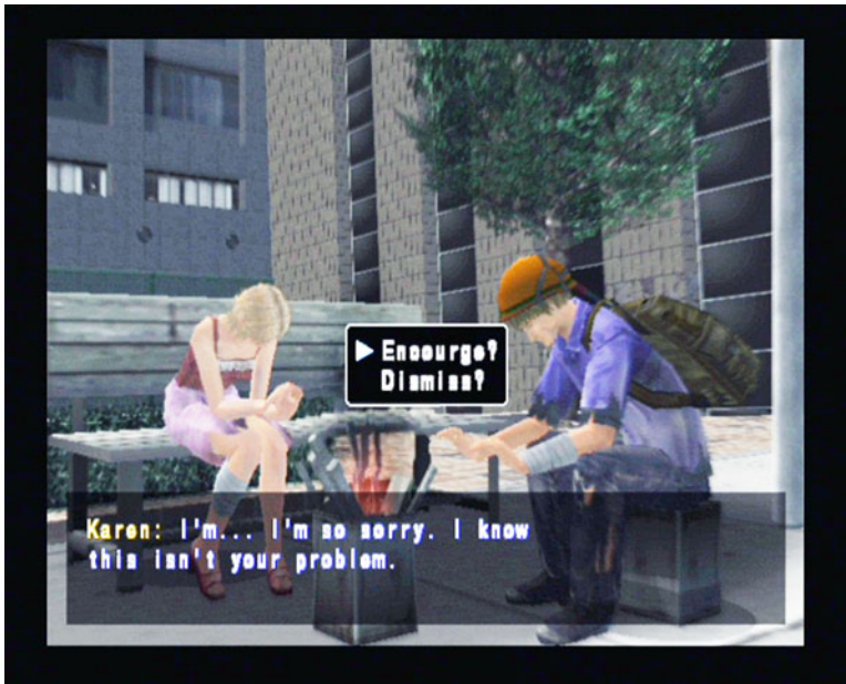
Figure 4. Players must choose whether to encourage or dismiss other characters and whether to act in their own self-interest or in the name of shared survival.

helicopter following the death of Land Minister Hatta. The game concludes with Masayuki vowing to write up the exposé with Jinnai's research and photographs once returning to the mainland. The more tragic ending has Masayuki and Mari climb a ladder to the roof of the building just in time to see the rescue chopper depart without them. With nowhere left to go, the couple embrace as the tower slowly sinks into the ocean.