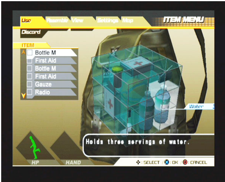
Figure 3. Inventory management is carried out by storing or removing items from Masayuki's backpack. This bag contains two plastic bottles each with three servings of fresh water.

impulse of perseverance or “ ganbaru ” that emerged as a rallying cry for Japan in the immediate aftermath of the quake.