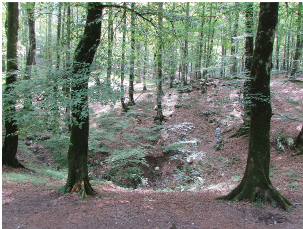
Figure 4. Example of a sinkhole.

considered as components of a single larger site, which has been disturbed by natural and human activities such as erosion and road building. Aside from the close proximity of the three scatters, there is significant homogeneity in the raw materials and lithic industries employed.