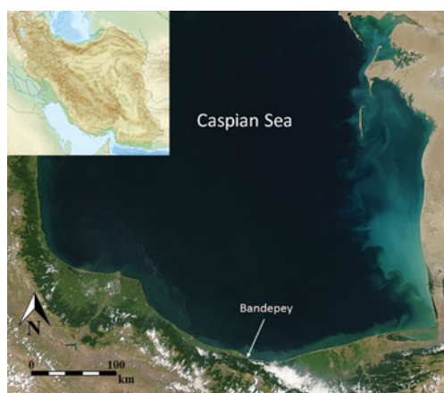
Figure 1. Location of the Bandepey Palaeolithic site near the south coast of the Caspian Sea.

Hamed Vahdati Nasab 1,* , Kourosh Roustaie 2 , Mohammad Ghamari Fatideh 3 , Fatemeh Shojaeefar 4 & Milad Hashemi Sarvandi 1