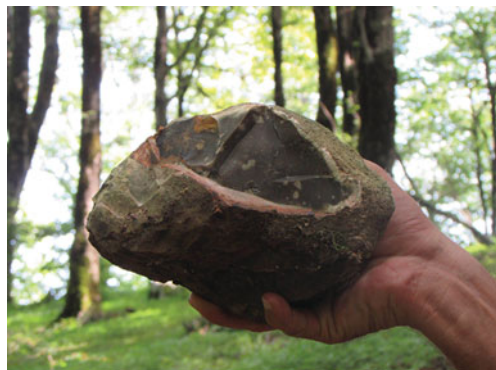
Figure 5. Example of a broken piece of natural rock with silicified parts inside.

considered as components of a single larger site, which has been disturbed by natural and human activities such as erosion and road building. Aside from the close proximity of the three scatters, there is significant homogeneity in the raw materials and lithic industries employed.