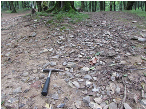
Figure 3. Density of artefacts on the surface.

therefore mainly observable in patches without vegetation, such as on the slopes affected by vehicles' tracks, or in the sections of small gullies created by seasonal rain. Our brief survey