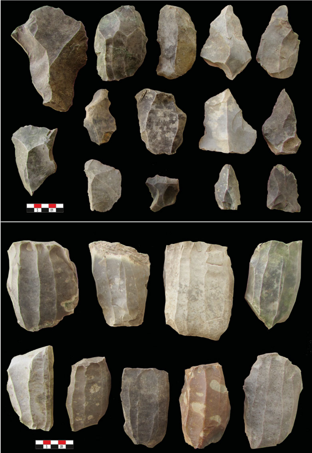
Figure 6. Examples of some of the collected artefacts in Bandepey: top) Levallois pieces; bottom) tongue-shaped blade cores.