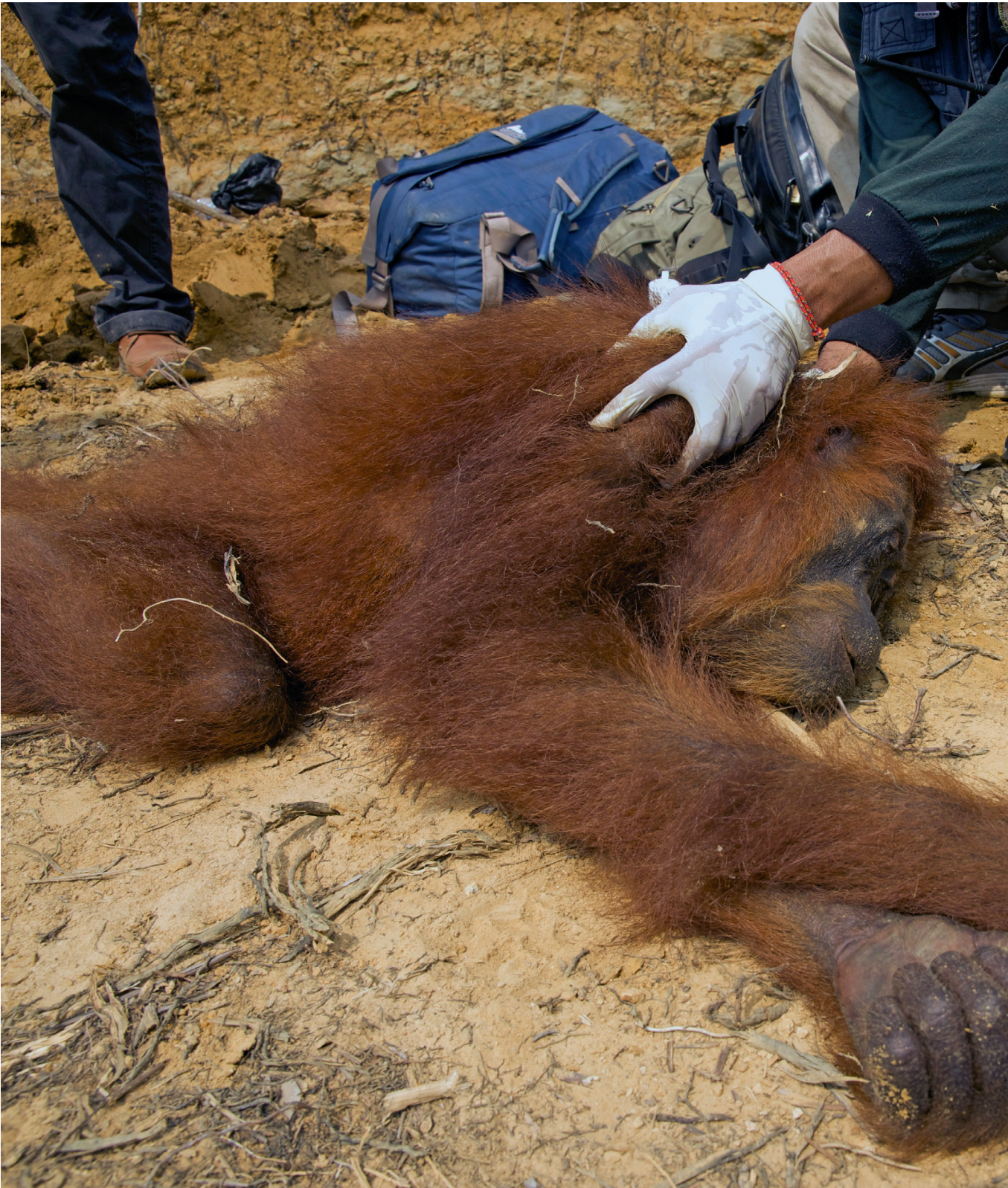
Photo: Natural and anthropogenic hazards imperil the survival of apes, especially if multiple threats affect already reduced and fragmented ape populations. © Jabrison (www.jabrison.photoshelter.com)