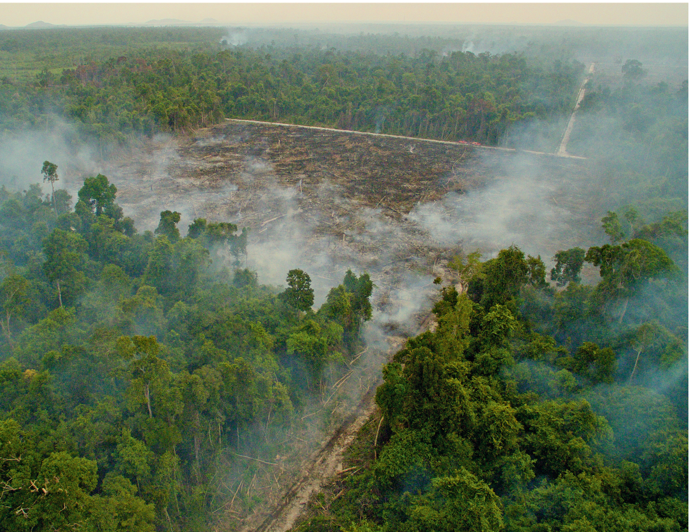
Photo: When hazards such as forest fires destroy habitat, for instance, apes' access to food and shelter drops significantly faster, causing declines in birth rates and population numbers. Freshly cleared patch of forest that has been burned for agriculture, Gunung Palung National Park, West Kalimantan, Indonesia.