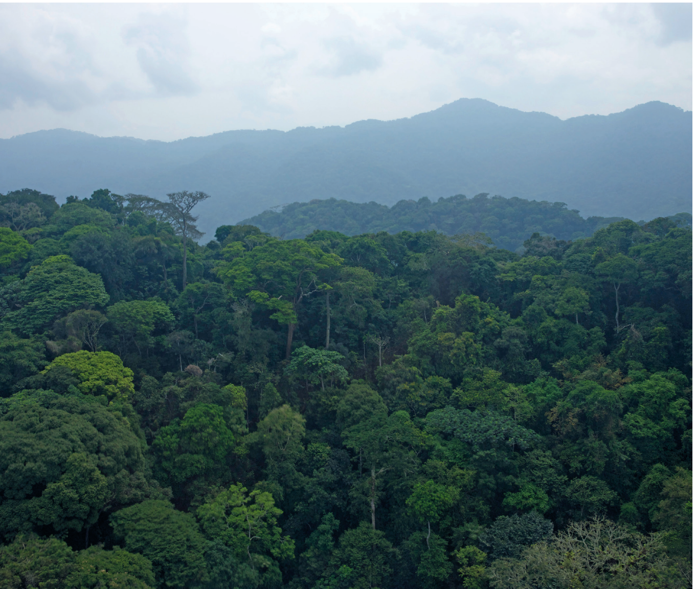
Photo: The long-standing practice of creating conservation areas is aimed at reducing the likelihood of impact from anthropogenic hazards such as forest fires, industrial incidents, dam failures, landslides associated with construction, and conflict situations.

and ability to meet the needs of apes can also influence the impacts of natural hazard, such as hurricanes, typhoons, lightning-caused forest fires, flooding and earthquakes. The larger the conservation area, the lower is the likelihood that a single hazard would be able to impact the entire area and its ape populations. As noted above, larger areas offer more opportunities to find scarce foods and shelter in and around a hazard-affected landscape (Behie et al. , 2019).