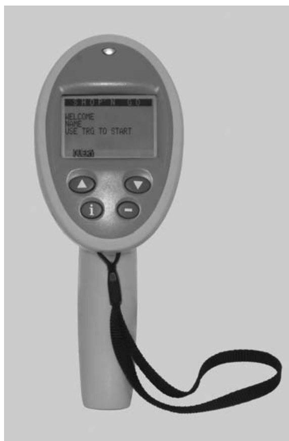
Fig. 1 Hand-held barcode scanner (Shop 'N Go system)

A 12-week single-blind RCT was conducted at a supermarket store in Wellington, New Zealand, between April