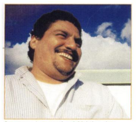
Symptoms: Low mood, suicidal thoughts Diagnosis: Depression

Symptoms: Palpitations, intense anxiety Diagnosis: Panic disorder