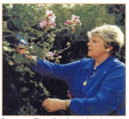
Symptoms: Sleep disturbance, hopelessness Diagnosis: Depression

Depression and panic disorder are seen across all age groups in both sexes. From the doctor's viewpoint, overlapping symptoms can make them appear similar. For the patients, the same effective treatment can make a real difference to their quality of life.