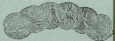
Gold Medal (Highest Award), Allahabad 1910.

Paris 1900, Brussels 1910, Buenos Aires 1910