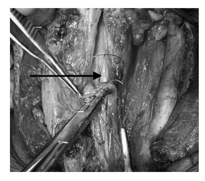
Figure 3. Extramucosal needle insertion and extraction in the pharyngeal closure, black arrow showing neopharyngeal lumen.

The Connell suture consists of two bites from the ipsilateral mucosal edge: the first bite comes from the outside of the mucosa through the inside of the mucosa and the second bite goes from the inside to the outside of the mucosa. This is then repeated on the opposite side. Gambee's suture is an interrupted suturing pattern in which one knot is left at the end of each stitch, which helps to prevent mucosal inversion. This method of suturing requires sufficient mucosal thickness near the stitch point. It is sometimes difficult to perform this suture accurately because of the inadequate thickness of the pharyngeal mucosa. In Lembert sutures, a far outside in and near inside out pattern on one wound edge and a near outside in and far inside out pattern on the corresponding side are applied. Penetration of the submucosa but not the mucosa is the characteristic feature of the Lembert suture. In this technique, with the subsequent sutures, the wound edges are merged to form a spontaneous inversion on a single plane.<sup>10</sup>