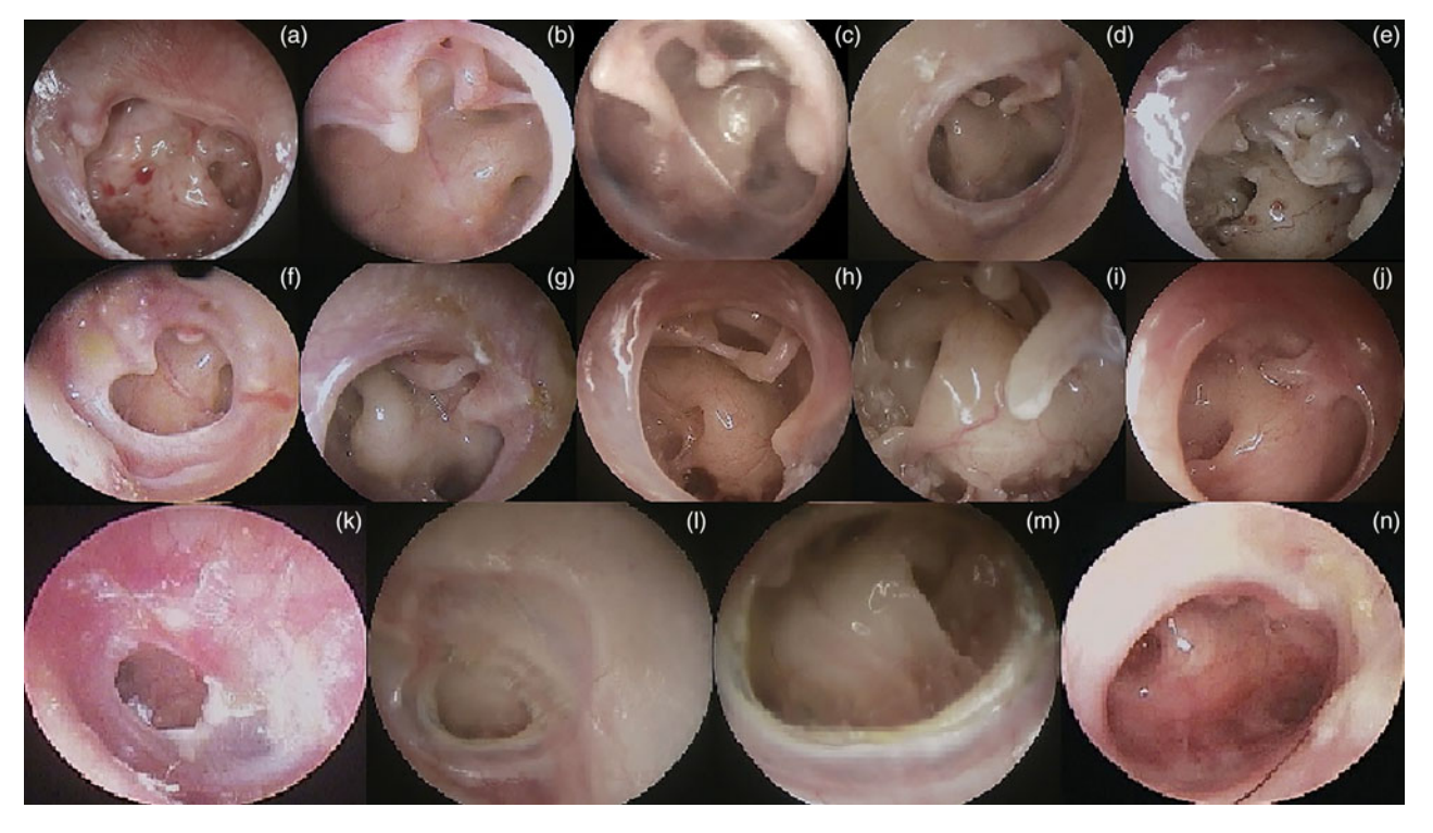
Figure 1. Otoendoscopy images as per the descriptions given in Table 1.