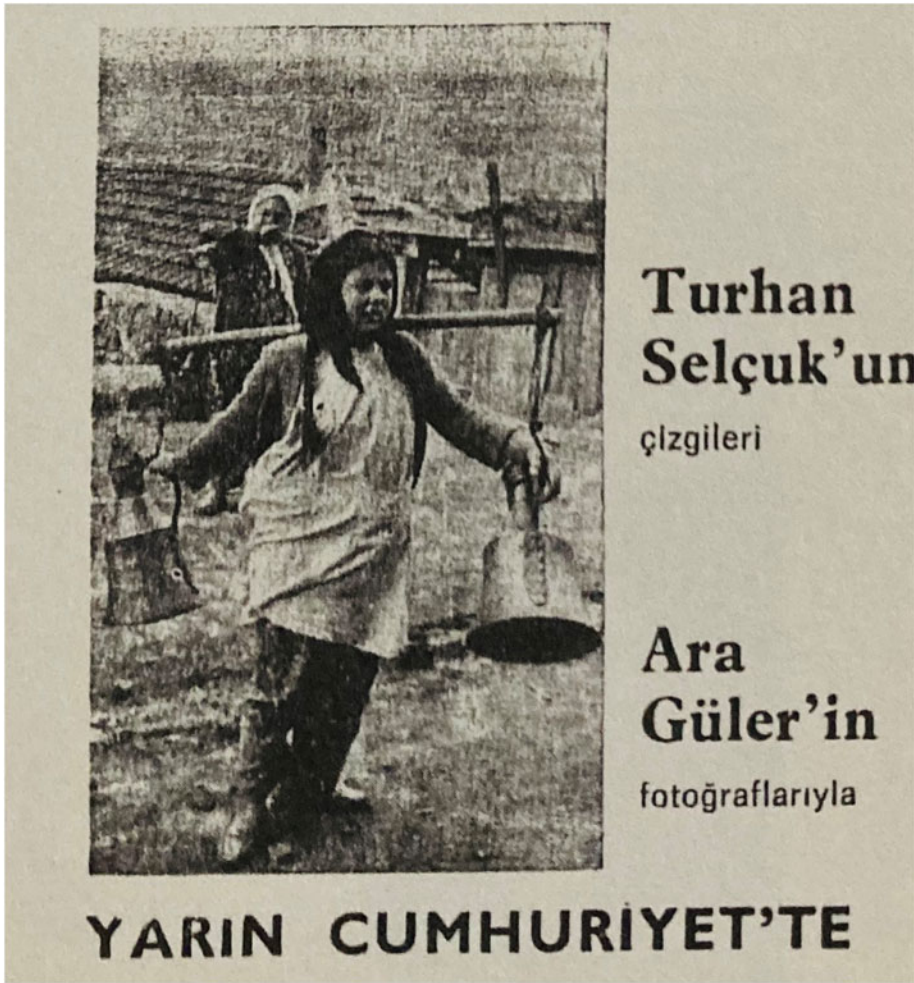
FIGURE 2. Advertisement for the series “Çocuklar İnsandır” (Children Are Human) noting Turhan Selçuk as illustrator and Ara Güler as photographer. Cumhuriyet , 13 September 1975.

Kemal’s “childlike, fairytale-like narration, as if the narrator and the narrated were all people of the same world.” 37 Kemal was a “wordsmith”, and proved his mastery in dialogue writing, incorporating children’s street lingo and turns of phrase into written literature. 38