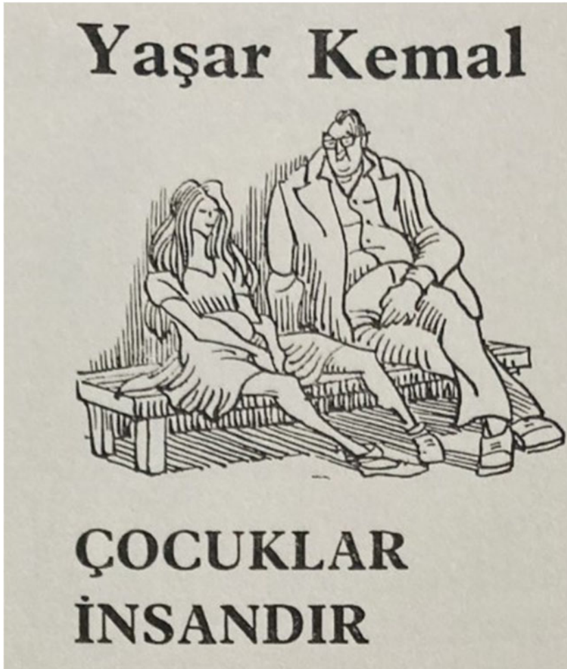
FIGURE 3. Advertisement for the series “Çocuklar İnsandır” (Children Are Human) depicting Zilo and Yaşar Kemal. Illustration by Turhan Selçuk. Cumhuriyet , 12 September 1975.

them, she realized that “there is no adulthood and no childhood among the Gypsies, everyone is equal. Everyone is like an adult.” 62 Yet, dancing publicly for hours with Gypsies in Dolapdere was unacceptable in the eyes of her stepmother, and Zilo was brutally beaten. She also ordered Zilo to leave the house and not come back.