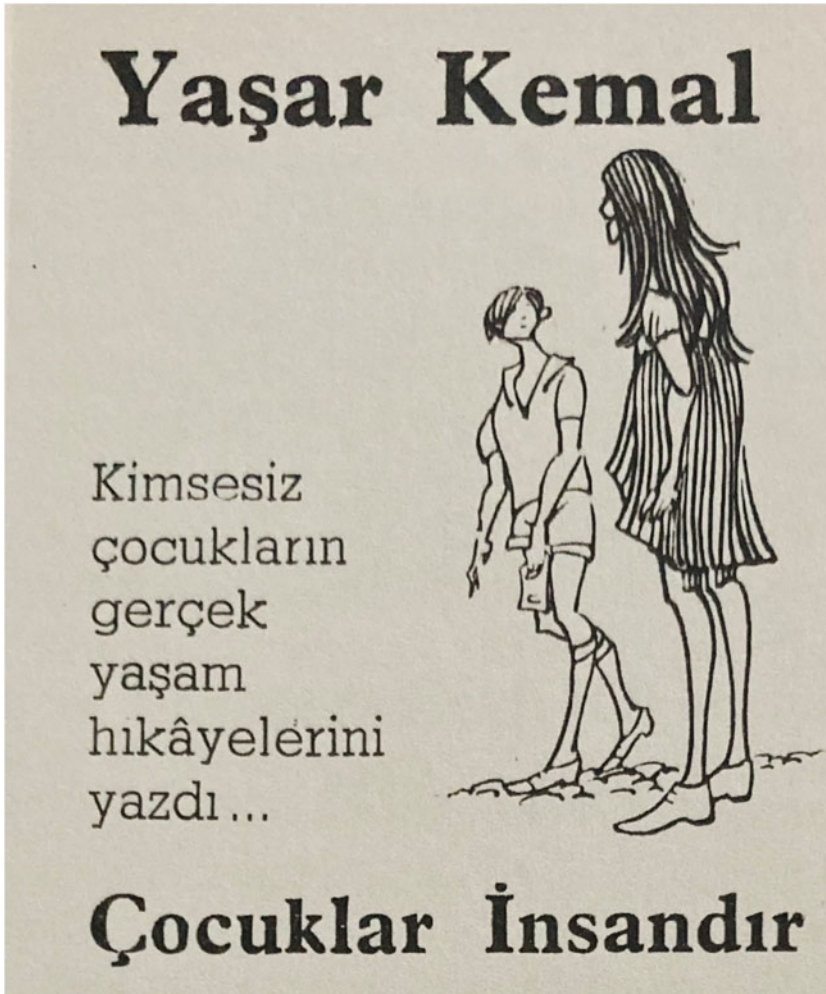
FIGURE 1. Advertisement for the series “Çocuklar İnsandır” (Children Are Human): “Yaşar Kemal has written the real-life stories of destitute children.” Illustration by Turhan Selçuk. Cumhuriyet , 13 September 1975.

typical placement for serial articles. 35 Daily installments, often filling up the entire page, were separated into several subsections with dramatic subtitles and were accompanied by the illustrations of the well-known cartoonist Turhan Selçuk (1922–2010) and photographs by the world famous photographer Ara Güler (1928–2018). Advertisements for the series, also featuring illustrations and photographs, appeared several days prior (Figs. 1 and 2). The first installment, entitled “Why Are Children Human?” (Neden çocuklar insandır?), was actually the introduction to the series in the form of an interview with Kemal conducted by the poet and the literary editor of Cumhuriyet at the time, Kemal Özer (1935–2009). The following installments sometimes focused on one child, sometimes a small group of children, tracing their stories in a number of episodes. 36 As to literary style, the series reflected