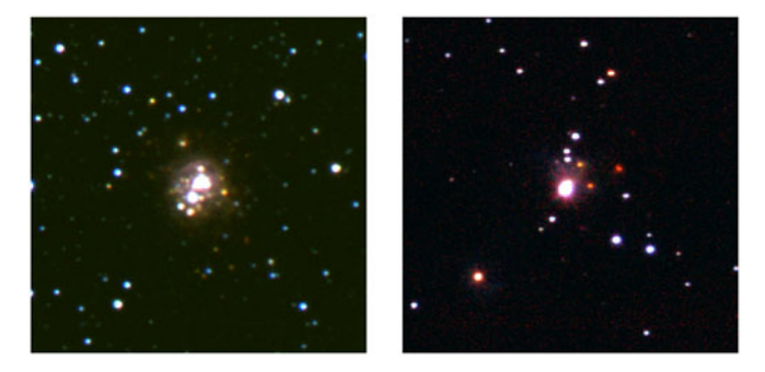
Figure 1. LIRIS/WHT infrared JHK<sub>S</sub> images, sized 1' \times 1' , of two A-SMASHeR targets: a compact cluster ( left ) and a relatively isolated central star surrounded by sparsely distributed faint objects ( right ).