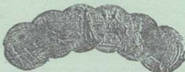
Gold Medal Allahabad 1910.

Paris 1900, Brussels 1910, Buenos Aires 1910.