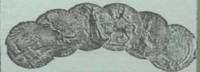
Gold Medal (Highest Award), Allahabad 1910.

Paris 1900, Brussels 1910, Buenos Aires 1910