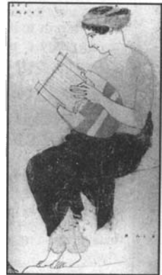
From Reading Sappho

Hellenistic Culture and Society , £13.95 paper