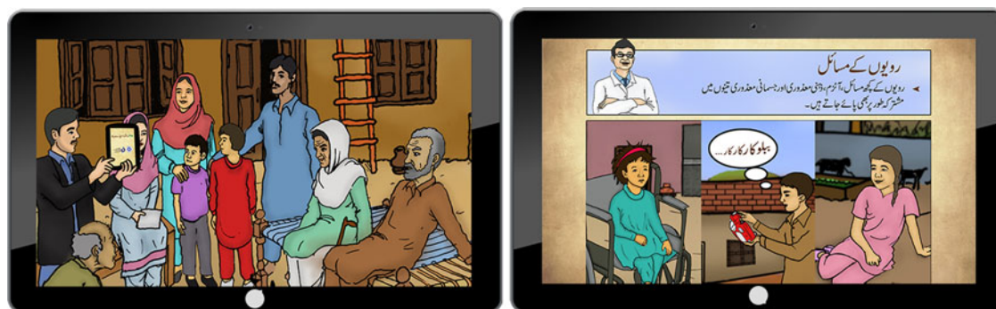
Fig. 2. Avatar-Assisted Cascade Training (ACT).

The champion family volunteers will be supervised by the trainers, who will be supervised by the master trainers on monthly basis. The fidelity of program delivery will be established by the master trainers by