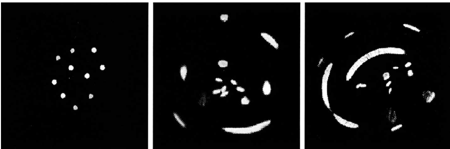
Figure 2. Giant luminous arcs and arclets (Figs. 2bc) resulting from the gravitational lens distortion of background galaxies (Fig. 2a) by a foreground cluster

ple pinholes screen, it was possible to reproduce, in a very inexpensive way, distorted images of background galaxies like the very impressive strong lensing artifacts seen behind the rich cluster Abell 1689 (cf. the color videotape of simulations by Tony Tyson).