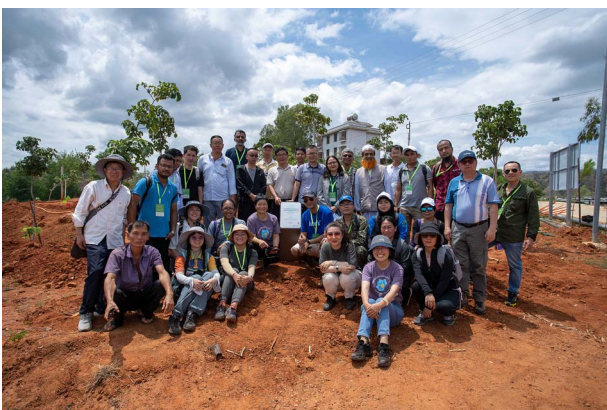
Transplanting Firmiana major at its reintroduction site, Fuming County, Yunnan Province, China, in July 2023.

During 15–29 July 2023, supported by the Key Research and Development Programme of Yunnan Province (202103AL140002), the first International Training Course on Conservation and Utilization Techniques of PSESP was offered at Kunming Institute of Botany, Chinese Academy of Sciences, Kunming. The 20 participants came from Azerbaijan, Bangladesh, Brunei, India, Indonesia, Laos, Myanmar, Nepal, Pakistan, the Philippines, Uzbekistan and Viet Nam. During the 5-day indoor session, techniques, case analysis and theory of the PSESP conservation system were introduced. In the subsequent field session, the participants visited the Western Yunnan Provincial PSESP ex situ and