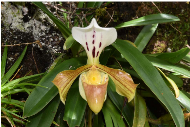
Paphiopedilum gratrixianum blooming in the wild.

P. gratrixianum requires urgent priority conservation. During our surveys we collected some seeds and we are now attempting to cultivate seedlings for ex situ conservation and scientific research, at Kunming Botanical Garden.