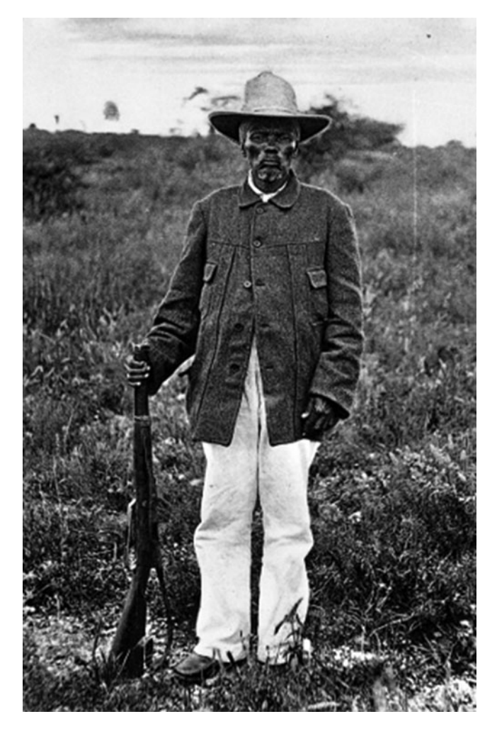
Fig. 2. Captain Hendrik Witbooi with rifle, ca. 1900.

African communities in the mid-1880s were, in fact, a significant problem for the German imperial government. Above all, instability threatened German economic interests: if colonial administrators could not guarantee stakeholders a return on their investments, commercial and industrial firms had little incentive to "modernize" the protectorate. Moreover, prolonged conflict discouraged potential German settlers from making the long voyage to southern Africa. German leaders therefore sought to bring an immediate end to the conflict between the Herero and Witbooi Namaqua.