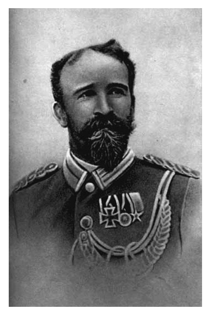
Fig. 4. Landeshauptmann Curt von François in military uniform.

Every ruler is chief over his people and country. When one stands under the protection of another, the subordinate one is no longer independent [or] master of his people or country. ... We are different nations, live by different laws and customs, and come from different countries. Each chief lives with his people according to his own laws and the conditions in which they find themselves.<sup>71</sup>