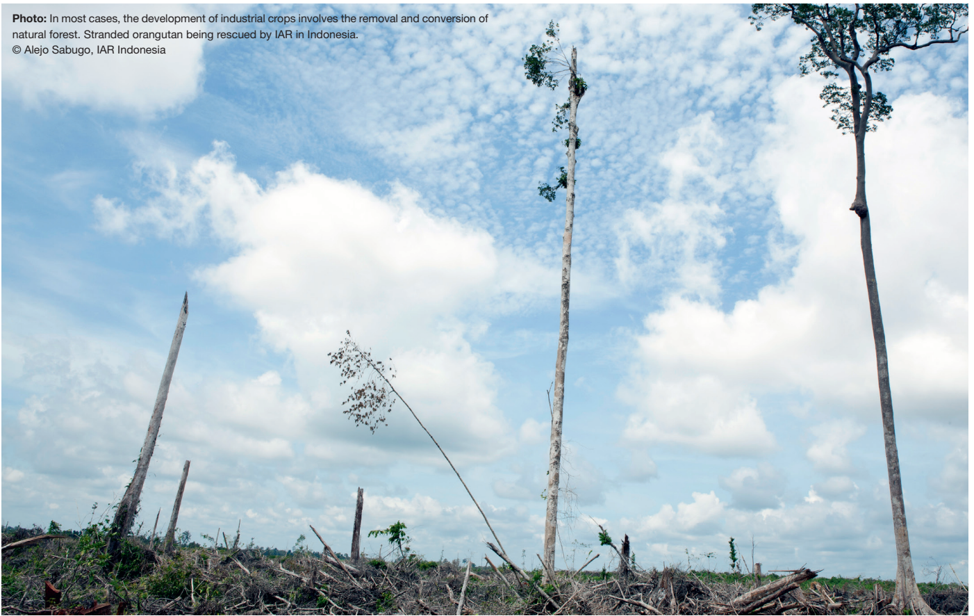
Photo: In most cases, the development of industrial crops involves the removal and conversion of natural forest. Stranded orangutan being rescued by IAR in Indonesia.

would result in the death by starvation of the majority of the individuals if there are no remaining forest fragments or nearby areas of intact forest in which the apes can seek refuge. Small-scale subsistence farming can involve the clearance of the majority of native plant species, but some trees and understory plants may remain. If such plants are present and the area borders on intact forest, gorillas are likely to continue to attempt to forage in this area if it previously constituted a part of their home range, particularly if they are habituated for tourism or research purposes (Kalpers et al. , 2010).