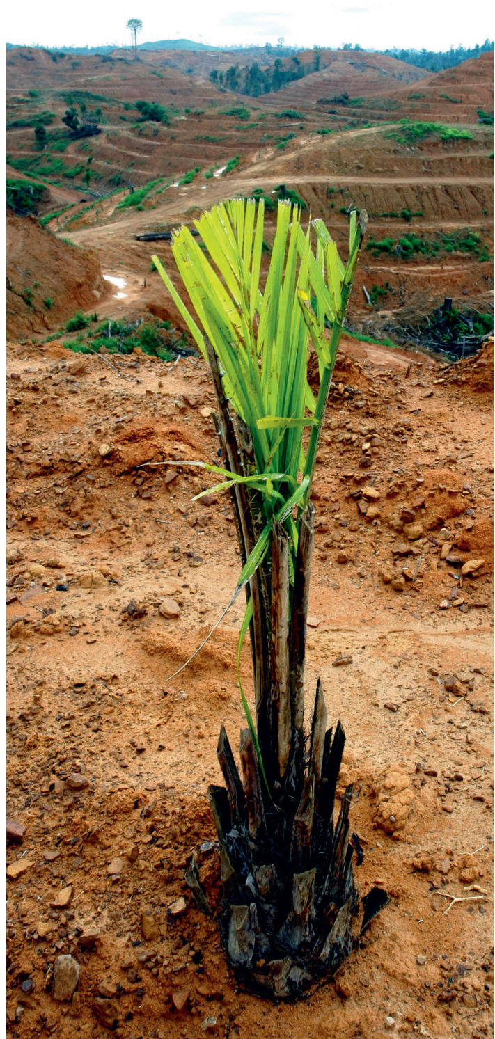
Photo: When forests are transformed into non-forest landscapes without adequate large-scale land use planning, which would include provisions for the survival and population connectivity of apes and other wildlife, the impact on the original biodiversity in general and resident ape populations in particular is devastating.

When forests are transformed into non-forest landscapes without adequate large-scale land use planning, which would include provisions for the survival and population connectivity of apes and other wildlife, the impact on the original biodiversity in general and resident ape populations in particular is devastating. Many designated high conservation value areas are too small or too isolated from other forests to be viable long-term habitats for apes. When forests are replaced with crops, most animals disappear, as described above. The compression effect—meaning the compaction of the habitat available to wildlife, which is sometimes referred to as the “crowding effect”—occurs when animals are exposed to disturbance in part of their range and thus start to use their home range differently; that is, they increase the use of parts that have not been affected.