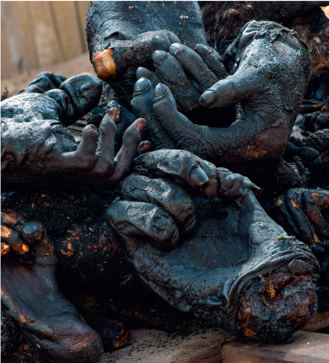
Photo: The opening of ape habitat for oil palm and other plantations increases conflicts between humans and apes across their range, and allows increased access to poach apes for the pet trade and for wild meat. Severed gorilla feet and hands await further smoking on a rack to be placed over a fire. This is a common method used for preserving wild meat, allowing suppliers enough time to get the product to market.