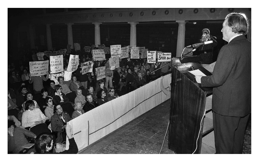
Figure 9.1 Protest during Taoiseach Charlie Haughey's speech at the opening of the National Forum on the UN Decade for Women 1975–85, Dublin, 15 November 1980.

earlier in the day that they planned to protest when Haughey arrived by throwing condoms at him. Haughey instead entered through a side door and the protest was abandoned. However, as soon as he rose to speak, a group of thirty female protestors stood up in the audience with posters relating to contraception (Figure 9.1). A CAP banner was unfurled as well as another printed on clear plastic which read 'Women's right to choose – clingfilm, Irish solution to an Irish problem'. Other placards called for the repeal of the Family Planning Act, with slogans such as 'Keep your filthy laws off my body' and 'Article 44 is alive and well and living in the Family Planning Act'. A newspaper account stated that Haughev ignored the protests and 'read straight through his script' despite some heckling at certain points.<sup>2</sup> While Haughey was apparently unfazed by the demonstrators, these protests drew attention at an early stage to the clear problems with the Family Planning Act, which would have implications for Irish men and women across the country trying to access contraception in the 1980s.