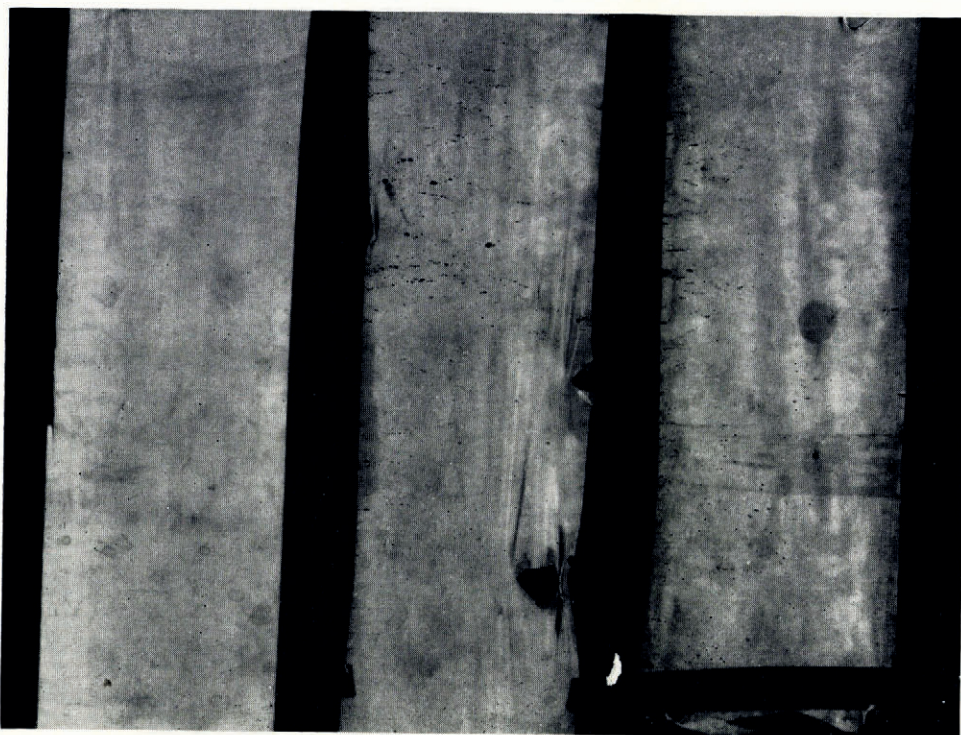
Fig. 4. Specimens of stretched rubber. The left-hand strip was exposed in the valley for six months, the other two strips were exposed in the tunnel. Note the pitting of the tunnel rubber, characteristic of the action of ozone

To revert to the odor reported by the guides. During the winter of 1961–62 I confirmed this was ozone by exposing lengths of (dentist's) elastic rubber in the end of the tunnel, and in the valley below, each weighted moderately, and repeated this test a second time (see Fig. 4). The rubber within the tunnel lost its elasticity as measured by the elongations considerably faster than the rubber in the valley; further, the "tunnel" rubber suffered severe pitting while the "valley" rubber was unpitted. This pitting and loss of elasticity of the rubber exposed in the tunnel is characteristic of ozone action on rubber. Figure 4 shows a photograph of samples of both after six months' exposure.