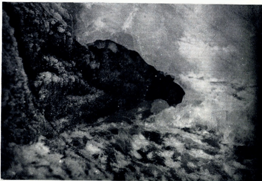
Fig. 2. Contact of ice and rock at 65 m. in the upper tunnel

The appearance of the ice at the rock interface was unique. As shown in Figures 2 and 3, the ice is drawn out, as though on a rack in a medieval torture chamber, as it is pulled downhill, slowly and relentlessly, under the pressure of an overlay of a 100 m. of névé uphill. Measurements of movement, over a period of several autumn months, indicated a displacement of about 60 cm./yr. for the ice, with respect to the rock.