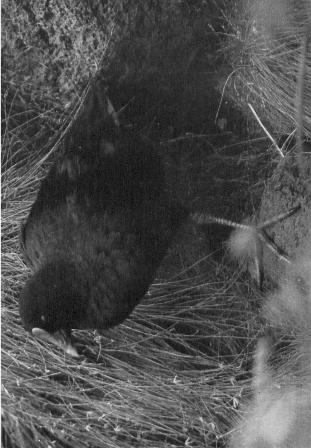
THE GOUGH ISLAND MOORHEN ( PORPHYRIORNIS C. COMERI )