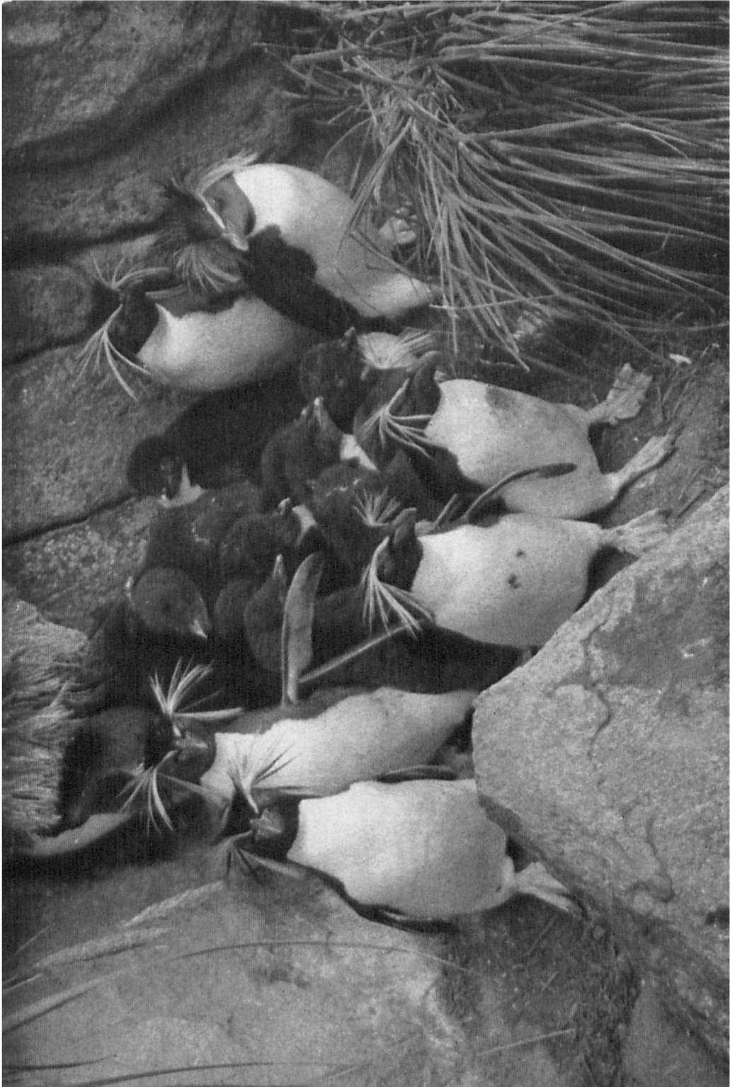
ROCKHOPPER PENGUINS, GOUGH ISLAND