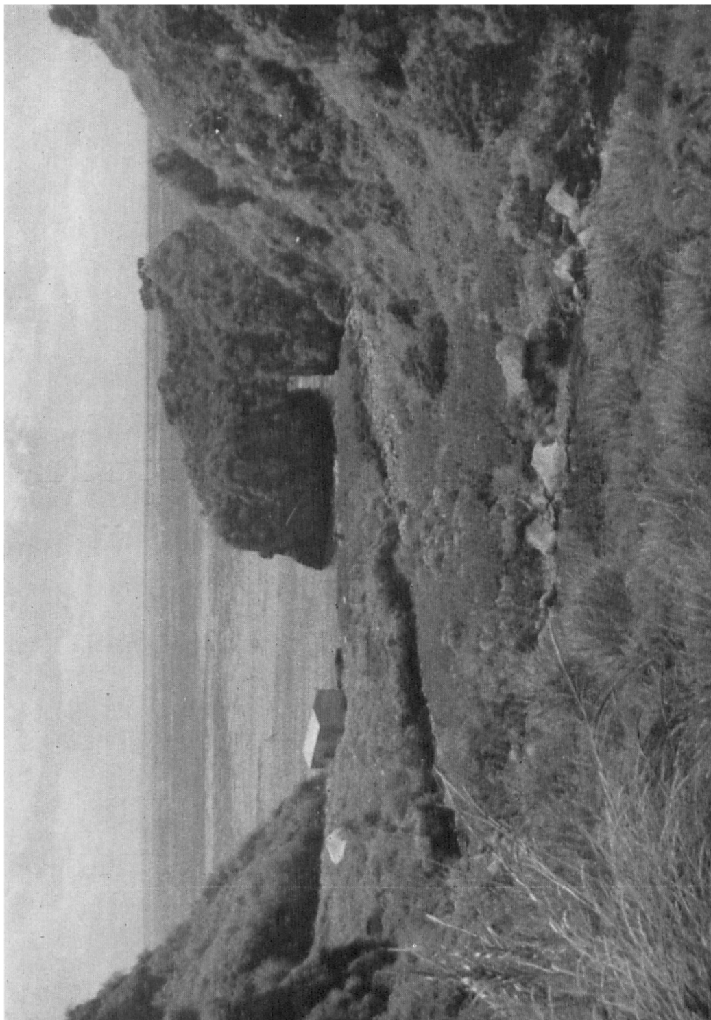
EXPEDITION BASE CAMP, GOUGH ISLAND