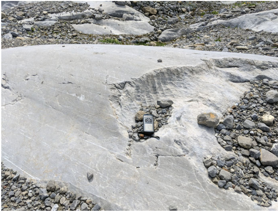
Fig. 3. Limestone bedrock in the forefield of Tsanfleuron Glacier, Switzerland. Ice flow was from left to right. Left half of the bed obstacle was smoothed by abrasion while step on the right side of the obstacle was excavated by quarrying. Hand-held GPS instrument for scale.