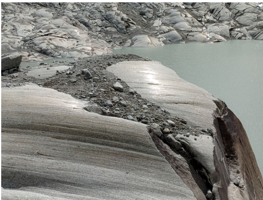
Fig. 4. Granitic bedrock in the forefield of Rhone Glacier, Switzerland. Ice flow was from left to right. Smooth section on the left of the picture was abraded, while the steep step on the right side of the picture results from glacial quarrying. Many similar features are visible in the background. The figure spans ~10 m across the photo.

others, 2006; Ugelvig and others, 2018). Transiently high water pressure expands cavities (Andrews and others, 2014), focusing the basal shear stress and overburden weight on smaller regions of the bedrock. Subsequent rapid declines of water pressure increase the quarrying stresses by reducing the water pressure that had 'buttressed' bedrock steps from their lee sides and supported the overburden. The nonlinear nature of fracture propagation implies that such temporary focusing of stresses can completely dominate the quarrying process (Hallet, 1996). Long-term maintenance of either exceptionally high or exceptionally low water pressure is unlikely because of negative feedbacks in the evolution of the water system. Transient highs in water pressure will increase cavitation and hence transmission of water, reducing pressure, whereas transiently low pressures will slow sliding and accelerate cavity closure, reducing cavity aperture