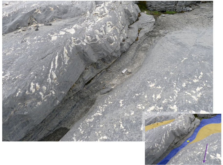
Fig. 1. Photograph of a Nye channel located in the fore-field of Castleguard Glacier, Canada, with annotated inset in lower right. A pocket multi-tool in the middle of the channel near the center of the picture is marked M in the inset. Ice flowed in from upper right to lower left, more-or-less along the purple arrow in the inset, and more-or-less parallel to water flow in the channel, which is shown in blue in the inset. Large areas of the bedrock free of white precipitate existed in subglacial cavities; the floors of two cavities are shown in orange in the inset.