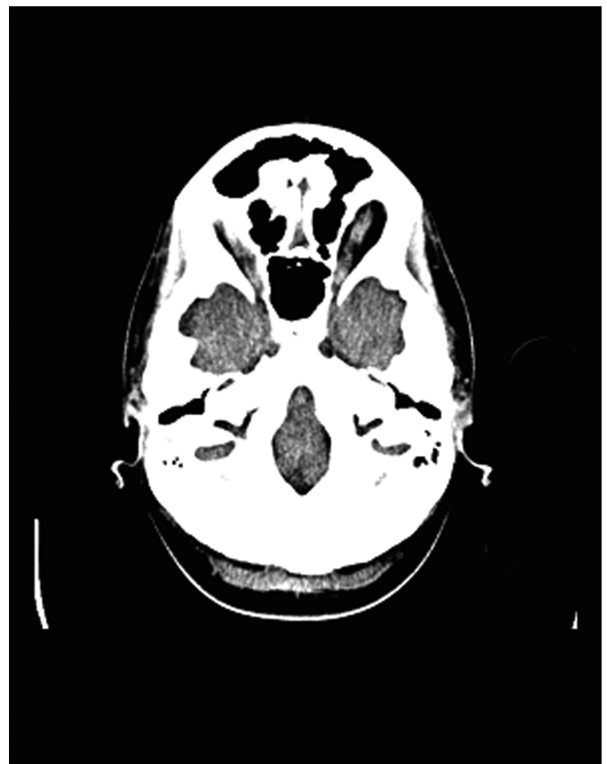
Figure 1: Axial computed tomography scan of the patient with osteopetrosis. Thickening of the bones at the skull base was observed but the optic canals do not appear significantly stenotic.

From the Department of Neurology (RN, FB, AO, FT, PL), Franz Tappeiner Hospital, Meran/o; Department of Neurological, Neuropsychological, Morphological and Movement Sciences, Section of Clinical Neurology (FB), University of Verona; Department of Neurology (PL), University Amedeo Avogadro, Novara, Italy; Department of Neurology (RN, ET), Christian Doppler Clinic, Paracelsus Medical University, Salzburg, Austria.