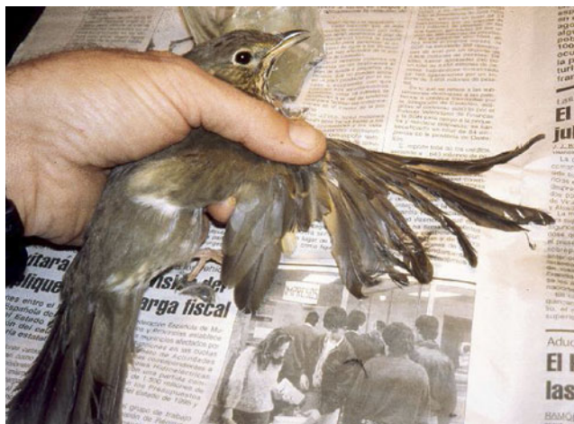
Figure 3. Effects of lime on Song Thrush feathers.

trapping levels are very high, the number of poachers prosecuted by government wardens decreased from 406 in 2003 to only 154 in 2008 (GER et al. 2009).