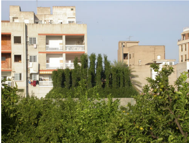
Figure 4. Parany inside an urban area.