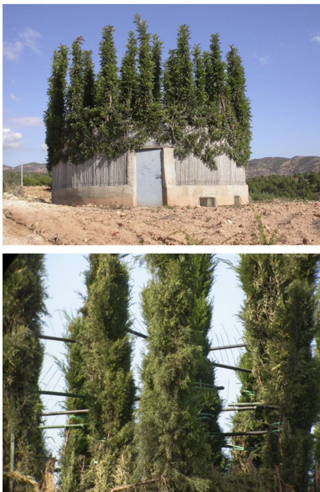
Figure 2. A typical parany . The lower photograph shows the placement of poles and sticks among branches.

The parany consists of a tree or group of trees (usually Olive Olea europaea or Carob Ceratonia siliqua although other species may be used) pruned in such a way that wooden poles perforated by small holes can be placed in branches of the crown (Figure 2). Until the 1960s, stalks of esparto grass Stipa tenacissima or other species were placed vertically in the wooden poles with