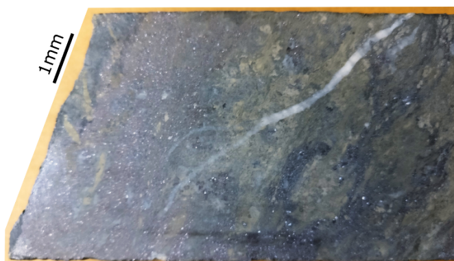
Figure 1. The upper section of the Lisheen half-core, showing the variation in grain size and mineralogy as well as the defined shear texture across a vein.