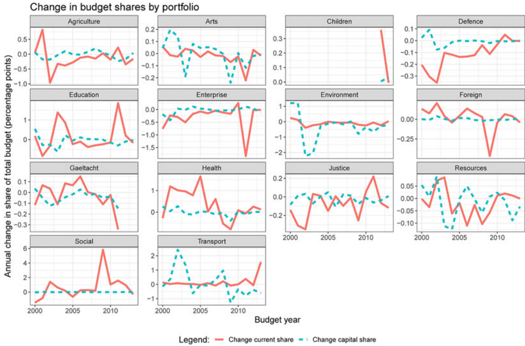
Figure 2. Annual differences in current and capital expenditures as shares of total budget, 1999–2013.

in debt and unemployment. The two variables are highly correlated with each other and we therefore estimate their effects in separate regression models. 3