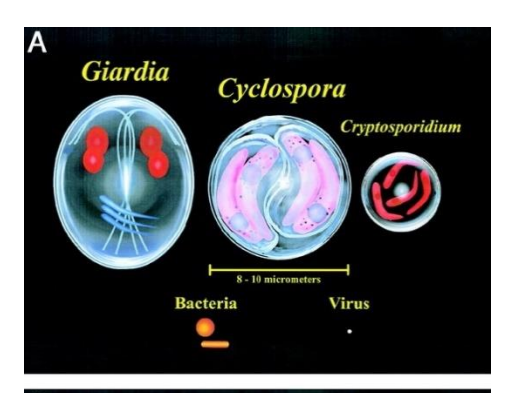
Figure 1. 300 dpi (A) versus 72 dpi (B) resolution

Graphics downloaded from the Internet: Graphics downloaded from Internet pages are not acceptable for print reproduction. These graphics are low-resolution images (usually 72 dpi), which are suitable for screen display but are far below acceptable standards for print reproduction (see fig. 1).